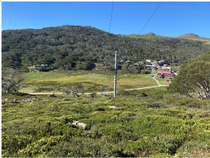
VIEW OF ACCESS TO TOWER 2, TOWER 3